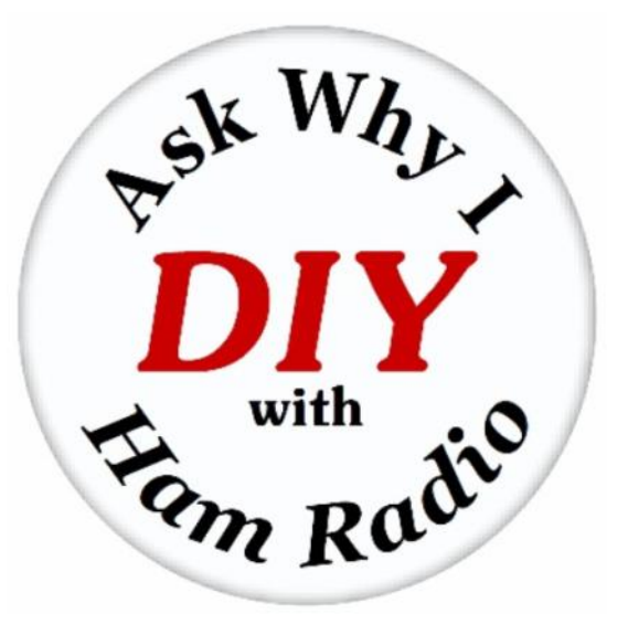
ARRL members can get this free button at the ARRL table at larger hamfests and conventions while supplies last.