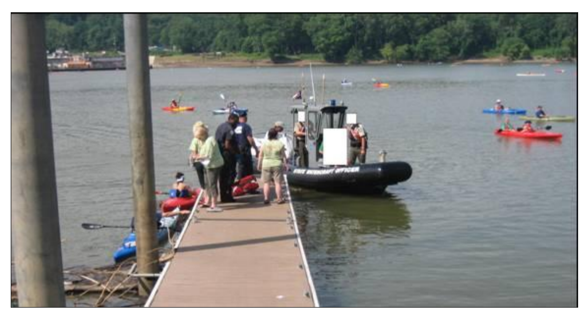
Police Boat meeting Fire and EMS personnel at the take-out point.