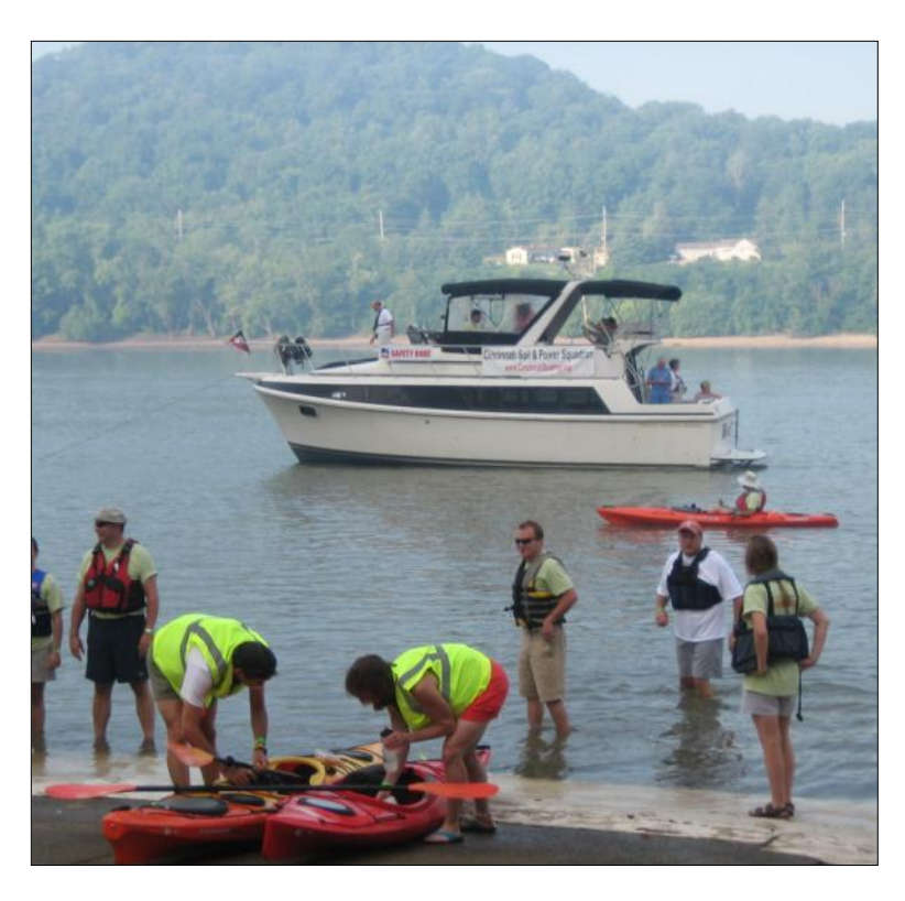
One Lucky HAM on the comfy Coast Guard Power Squadron