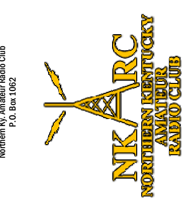
NKARC Feedline November 2005 Volume 2005 Issue 11